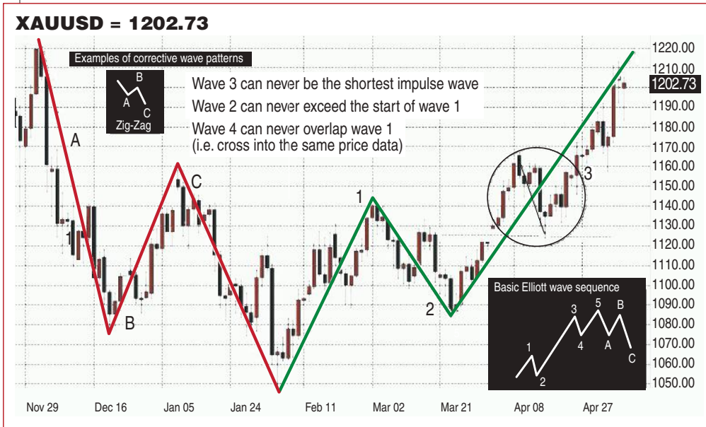
FIGURE 3: DAILY US/UAX (FOREX GOLD) CANDLESTICK CHART WITH ELLIOTT WAVE RULES. Here you see a basic example of the wave count with all three rules in place. Because rule 3 states that wave 4 can never overlap wave 1, you have a clear indication that the current wave 3 has not ended.

You can create a triple filtering system at points where all three indicators are in confluence.