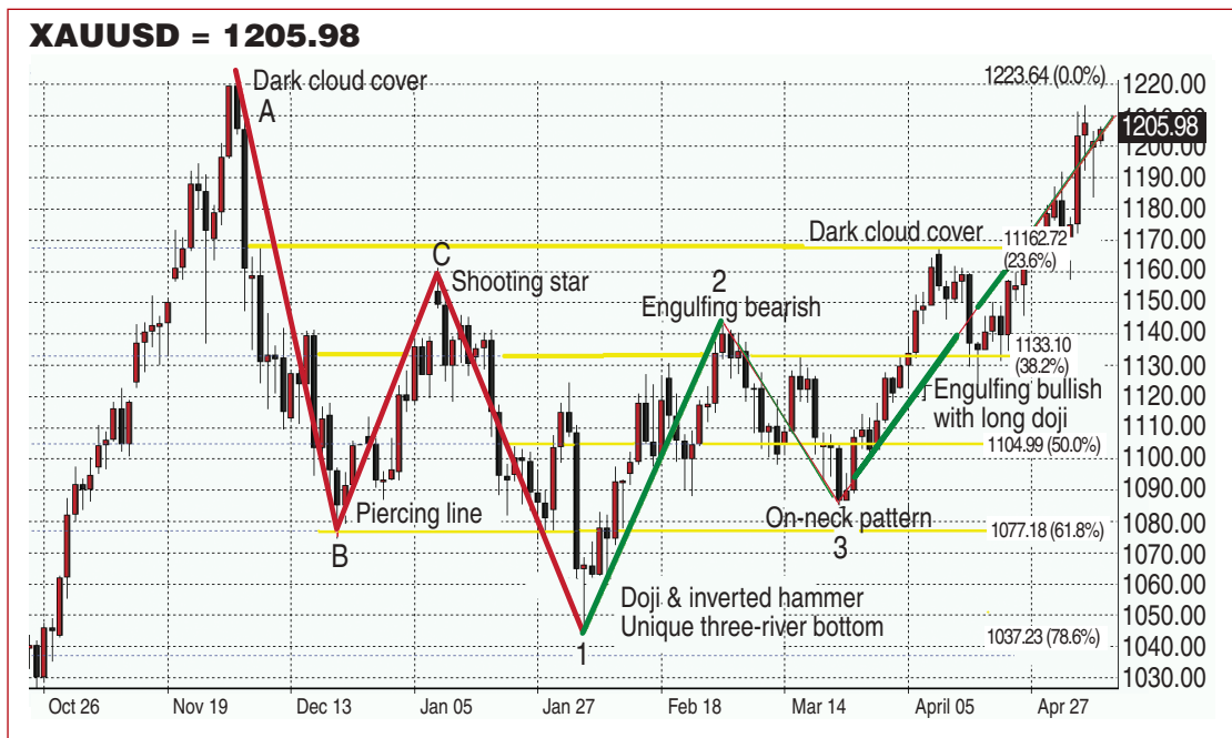
FIGURE 5: DAILY US/UAx (FOREX GOLD) CANDLESTICK CHART WITH ELLIOTT WAVE, FIBONACCI, AND JAPANESE CANDLESTICK PATTERNS. The first corrective phase's wave (A) trades to a low of $1,077, the 61% Fibonacci retracement point. Wave B trades higher, finding resistance just below the 23% Fibonacci resistance level. A shooting star marks the top and end of wave B. Wave C breaks below the 61% retracement point and just before it reaches the 78% retracement point, multiple candlesticks and a rare candle pattern known as the unique three-river bottom form.

Figure 5 examines all three components of this technical triad: Elliott waves, Fibonacci retracements, and candlestick patterns. You can create a triple filtering system at points where all three indicators are in confluence.