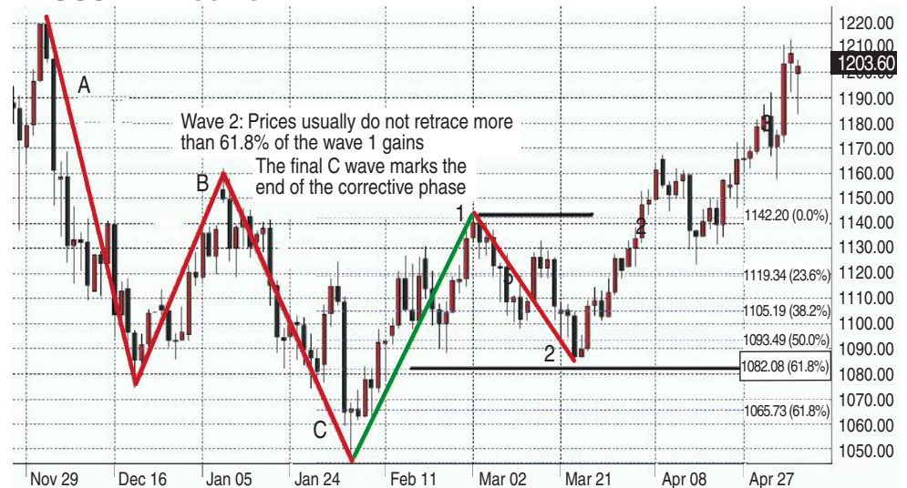
FIGURE 2: DAILY US/UAX (FOREX GOLD) CANDLESTICK CHART FROM CORRECTIVE PHASE TO CURRENT MOTIVE PHASE. The first wave (1) occurred on February 2, 2010. From a low of $1,040 per ounce, gold climbed $100 higher to more than $1,140. Gold prices moved from the 78% retracement level to above the 38% retracement level on this single wave. This signaled the first corrective wave (2).