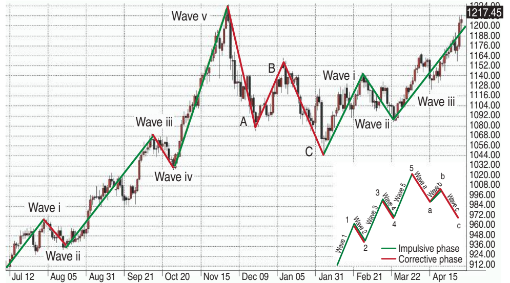
FIGURE 1: DAILY US/UAX (FOREX GOLD) CANDLESTICK CHART WITH ELLIOTT WAVE COUNT. The motive phase drove gold to a new historical high of $1,221 in December 2009. The corrective phase in forex gold lasted from December 2009 to February 2010.

By combining these methods, you can produce greater insight.