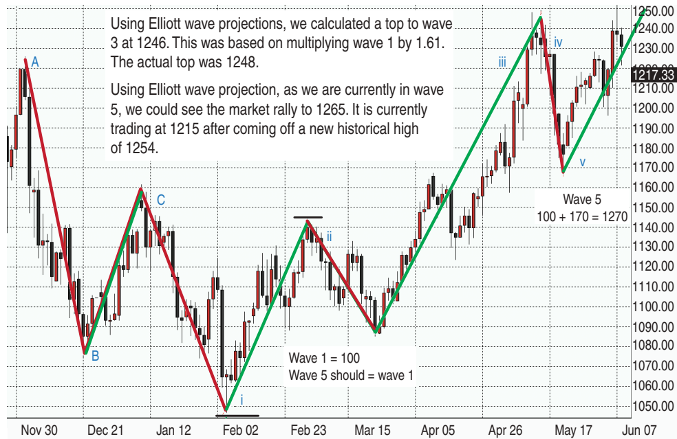
SIDEBAR FIGURE 1: XAUUSD. Using Elliott wave projections, a top to wave 3 was calculated at 1246.

Using Elliott wave projection, as we are currently in wave 5, we could see the market rally to 1265. It is currently trading at 1215 after coming off a new historical high of 1254.